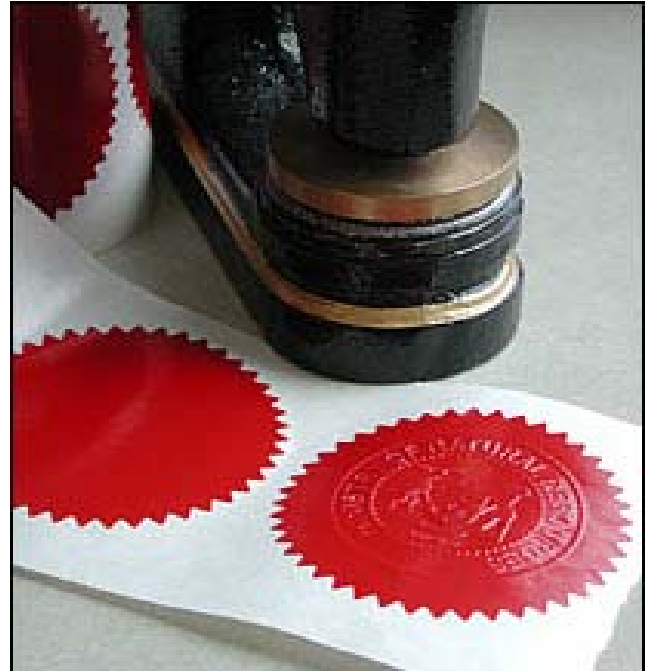
Ministry of Natural Resources seal

Provide as much information as possible about the Crown Patent record being requested; specifically, the original (geographic) township name, and the lot and concession. If you know the name of the original grantee and the date of the patent, please also include them. The original grantee is the person to whom the Crown Patent was originally issued when the land was first transferred from the Crown.