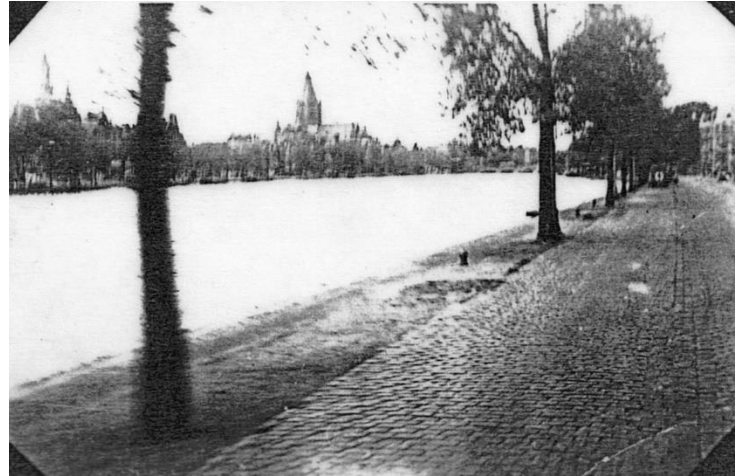
Street scenes from Holland."