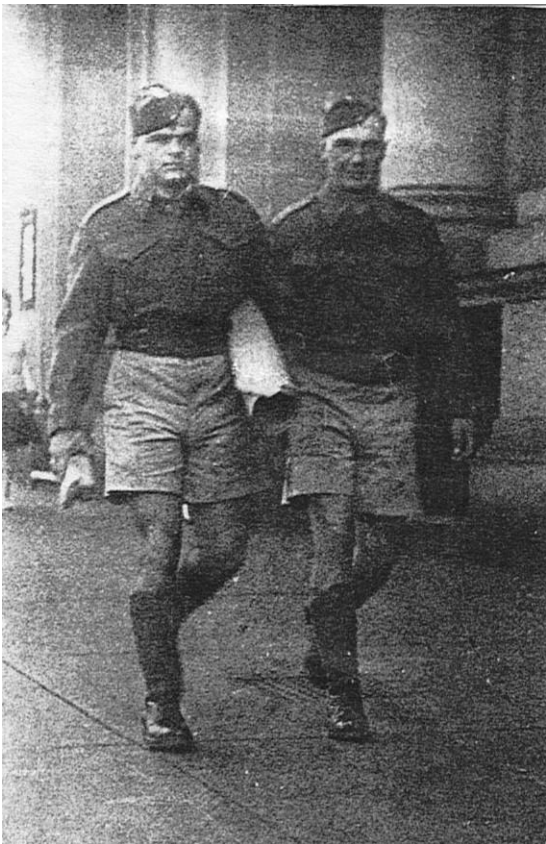
Somewhere in Europe with a fellow soldier.