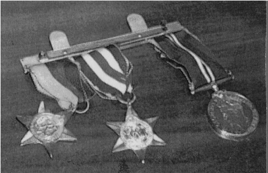
Cecile Laderoute medals.